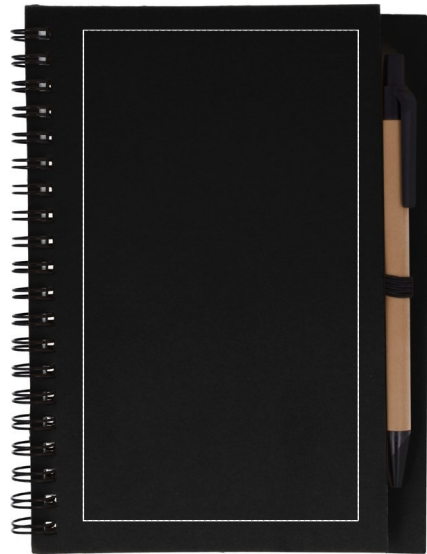
4. FRONT SCREEN