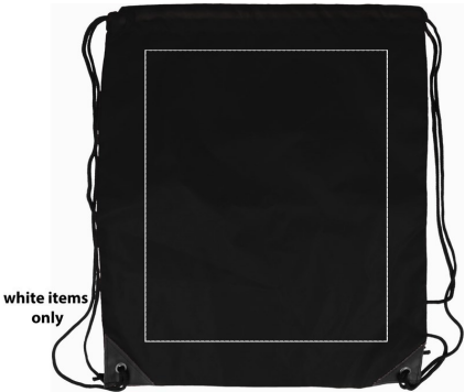
3. FRONT ON WHITE